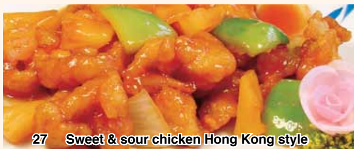
27 Sweet & sour chicken Hong Kong style