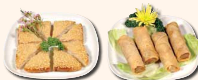
3. Sesame prawn on toast